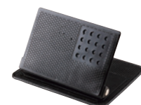
Controller stand [PS-100]