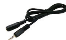
EXTENSION CORD FOR HANDPIECE [PE-100]