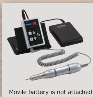
Mobile battery is not attached

Enable to use as mobile grinder by using not only Ac adapter but also mobile battery. (However, maximum speed of rotation will be changed by output voltage.) Avoid to waste electricity by sleep mode if you forget to turn the power off.