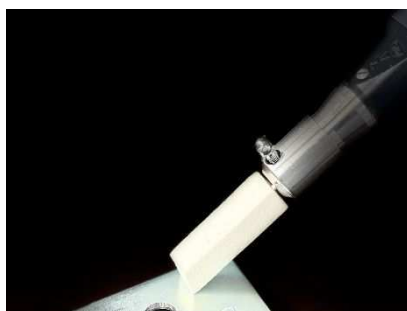
Scan the QR code for more detail about Handpieces