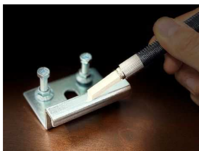
Scan the QR code for more detail about Hand Holder

When used with compound, it delivers excellent results in fine scratch removal and gloss finishing.