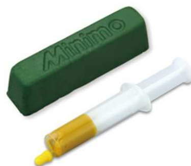
Scan the QR code for more detail about compound