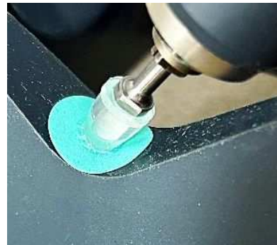
Flexible enough to conform to curved and intricate shapes with ease