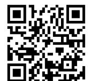
Cautions for Use

Scan the QR code to see the product in action